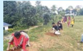
Tree plantation on environmental day