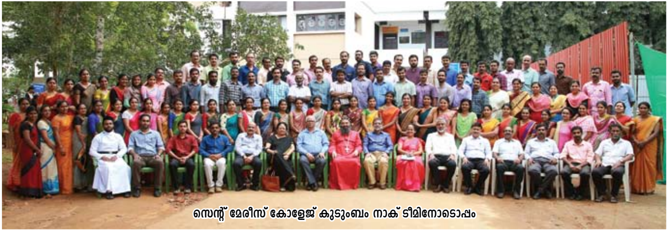
സെന്റ് മേരീസ് കോളേജ് കുടുംബം നാക് ടീമിനോടൊപ്പം