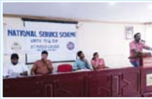
Reading week celebration

NSS units also observe special days by organizing various programs. This year unit observed Environmental day, Independence day, reading week, aids day, NSS day and republic day. Special guests gave talk on the occasion and various programmes has been conducted for the volunteers. As part of regular activity NSS volunteers plant trees in the campus and cleaning has been done. Unit maintains a blood group directory holding the blood group details of over 1200 students. Unit took initiative to help people in the adopted colony by supporting in their house construction works. Also, NSS unit work by joining hand with the forest department in senna plant removal project.