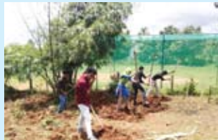
plantation of vegetable garden