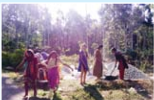
Supporting house construction

NSS units has initiated a project called 'Snehabhavanam', to help homeless in 2018. Through these project NSS units has